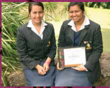
Auckland Girls Grammar