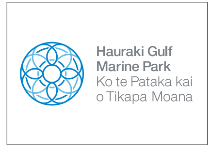
Hauraki Gulf Marine Park visual identity