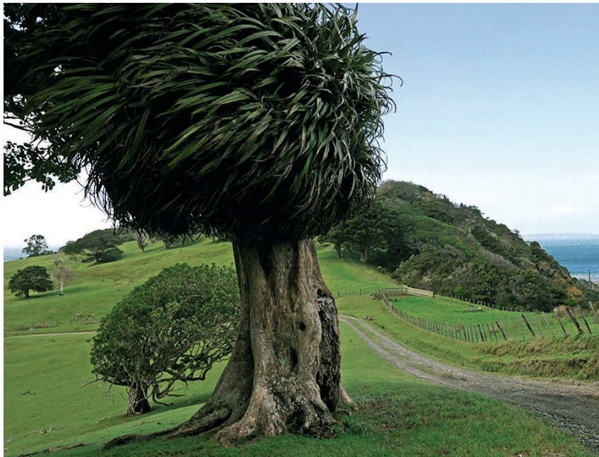
Te Muri Regional Park

farming zone near Coromandel Harbour, primarily for fish farming. The zone would be 300 hectares in size (3 kilometres long and 1 kilometre wide) and cater for between 4000 and 8000 tonnes of fish farming. A Ministerial Advisory Panel was appointed to hear submissions and report back to the Minister.