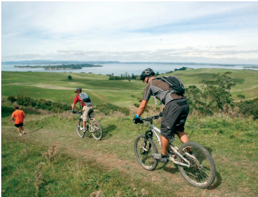
DUAL participants on Motutapu