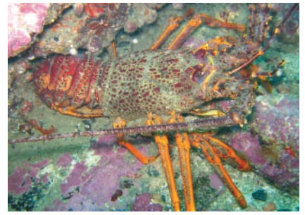
Mature crayfish at Tawharanui