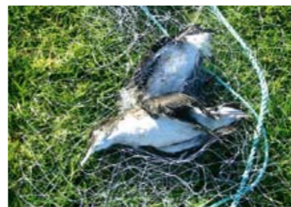
Set net deaths