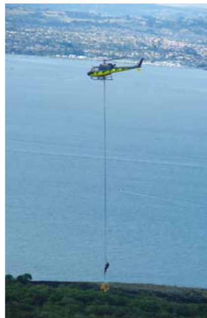
Pest bust on Rangitoto

www.doc.govt.nz/conservation/threats-and-impacts/animal-pests/pest-control/rangitoto-and-motutapu-islands-restoration-project/