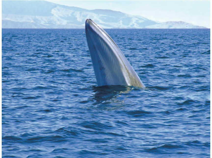
200 critically threatened Bryde's whales live in the greater Hauraki Gulf area and use its sheltered bays for breeding. They are vulnerable to vessel strike, habitat degradation and over fishing.

Outside of the public conservation estate, habitat modification and disturbance resulting from urban and peri urban development is a significant pressure on biodiversity. Pests and weeds are a significant pressure everywhere.