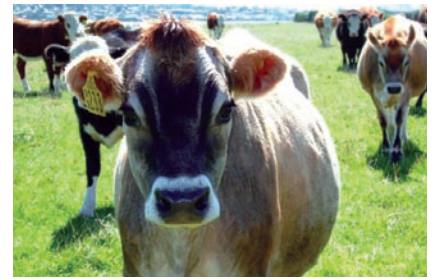
There are 410,000 cows on the Hauraki Plains producing the same amount of faecal matter as a city of 6 million people.