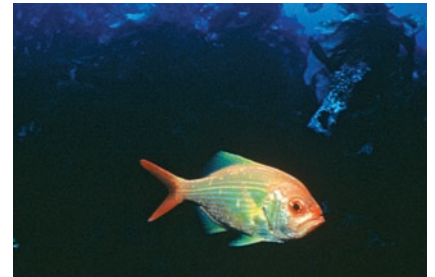
Analysis of MFish data suggests the recreational take of snapper in the inner Gulf area is likely to be 35% greater than commercial take.

specific sites and to embrace Maori perspectives. Whakapapa (ancestral links) provide a connection to the past that remains relevant today, shaping the way in the way Maori interact with the natural world and exercise kaitiakitanga (guardianship).