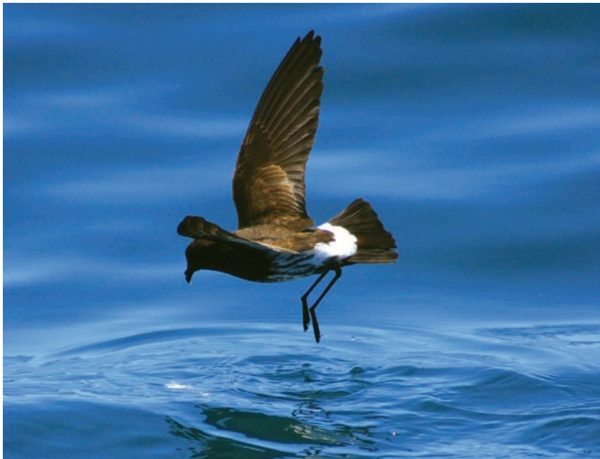
Pest eradication on islands is almost certainly responsible for numerous sightings of the New Zealand storm petrel in the Hauraki Gulf over the past three years. It was thought extinct until 2003.