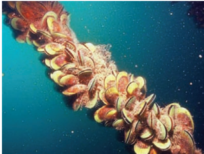
Demand for mooring and marine farming space in some areas is increasing.