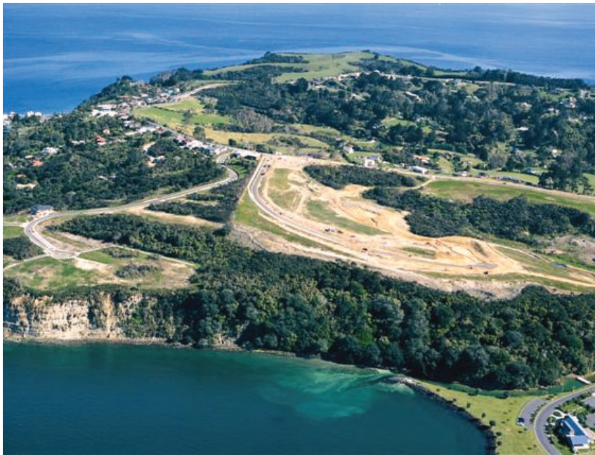
Regional parks now provide the only buffer to existing or planned coastal development between Auckland and the Mahurangi Harbour. Could the same pattern emerge south of Auckland?