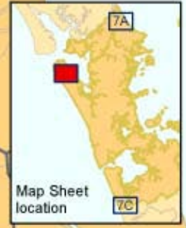
Map Sheet location