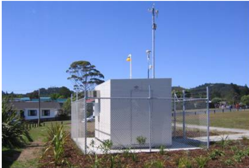
Ceramco Park Site in Glen Eden (established December 2005)

The rural Pukekohe PM 10 site is expected to provide information on the contribution of PM 10 in the urban areas which may not be from urban sources. Nitrogen oxides and ozone are also measured at this site to see whether rural areas are affected by pollution from the city.