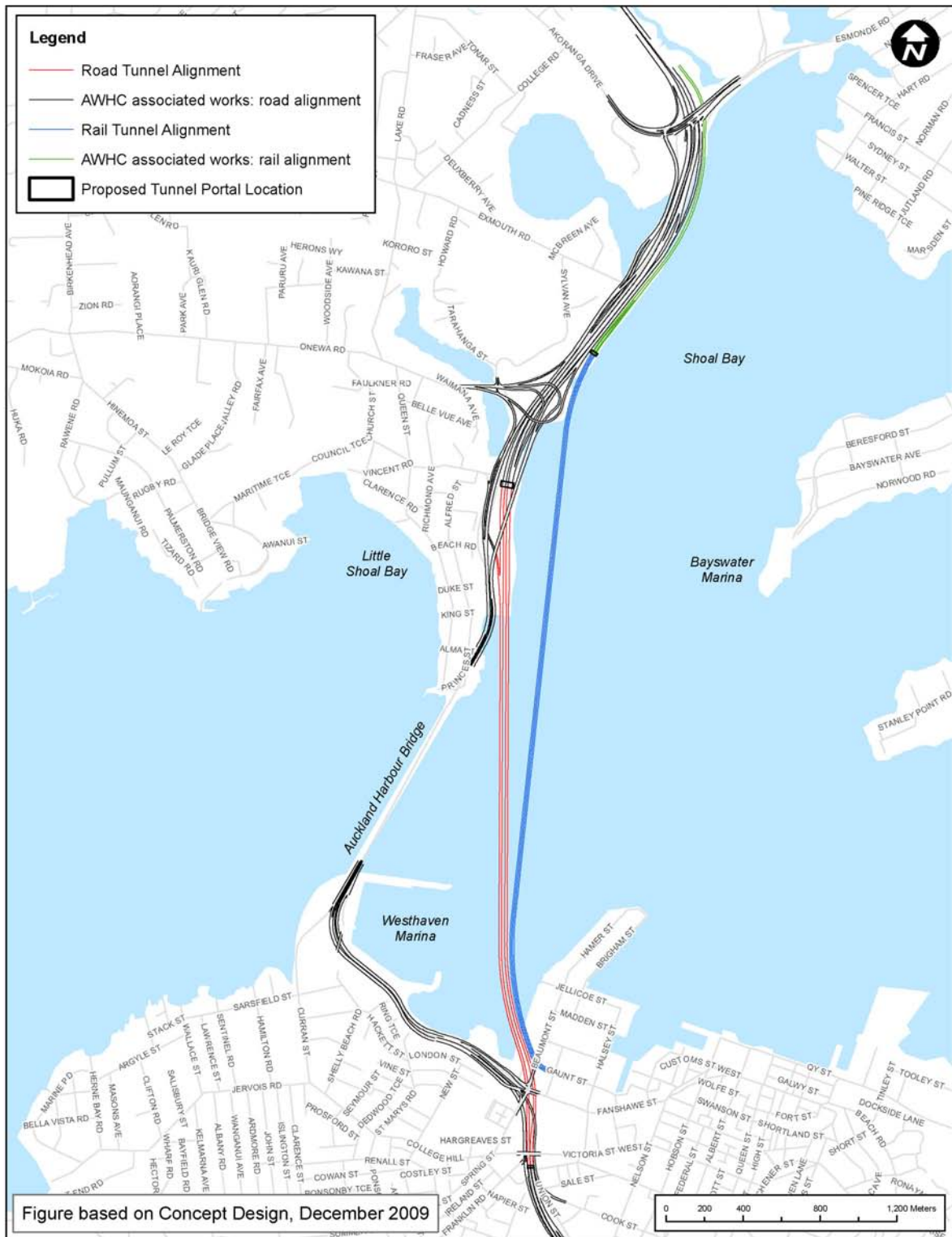
Figure 25.1 Indicative location of the additional Waitemata Harbour Crossing Route