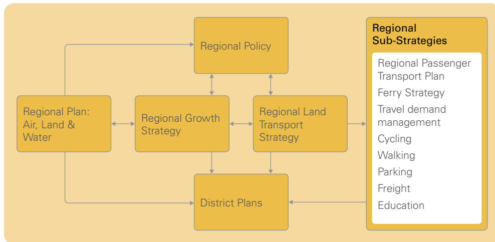
Figure 4.3 Policy environment that influences vehicle use in the Auckland Region

There are few mandatory controls on motor vehicles at present in spite of a rapid growth in numbers. Individual vehicle emissions will reduce over time as more vehicles with clean technology (such as catalytic converters) enter the fleet. However the rate of fleet turnover is slow and, as illustrated by Figure 4.2, clean fuels and good vehicle maintenance are also critical for vehicle emission control. There are currently no requirements for used imported, or in-use vehicles, to have operating emission control equipment, or to meet any maintenance or emissions standards. Central government regulations require that "sulphur free" petrol and diesel be available by 2010. This date could feasibly be brought forward.