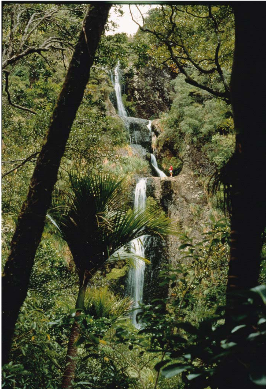
Figure 2: The steep nature of the Waitakere Ranges influences fish distribution. Only longfinned eel, koaro and banded kokopu are likely to move above this waterfall.