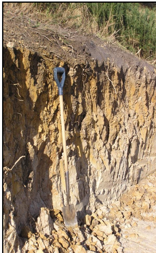
Figure 4. Low permeability Ultic Soils, showing coarse blocky structures and grey mottling in the subsoil, on Waitemata Formation sandstone in the West Auckland area. (Scale in 10 cm increments. Note: the surface white material is hydroseeding mulch.)