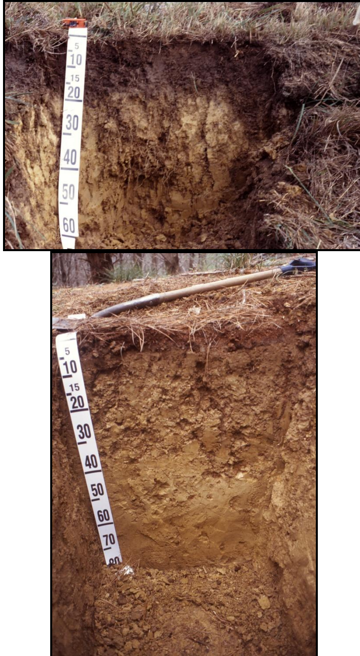
Figure 6. Low permeability Ultic Soils from the North Auckland area. (scales in 10 cm increments)

Examples (from: Wilson et al. 1975; Orbell 1977; Purdie 1981; Cox et al. 1983; Sutherland et al. 1985a & b; Hicks 1996; McLeod & Jessen 2000) of the high permeability Allophanic soils in the Auckland Region are: Otao series, Waitemata series, Karaka complex, Torehape complex, Manukau series, and Hapludands.