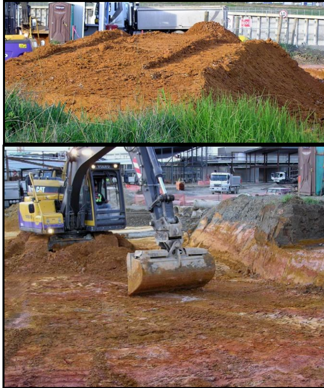
Figure 8. Moderately permeable subsoil from a Granular Soil on red weathered Waitemata Formation stripped for retail/industrial development at Albany.