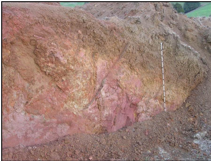
Figure 2. A moderately permeable Granular Soil on red weathering in Waitemata Formation sandstone in the South Auckland area. (scale in 10 cm increments)