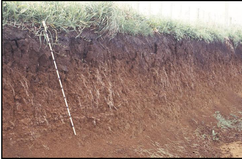
Figure 3. A moderately permeable, clayey Granular Soil, showing fine blocky structure and no mottling, from the South Auckland area. (scale in 10 cm increments)