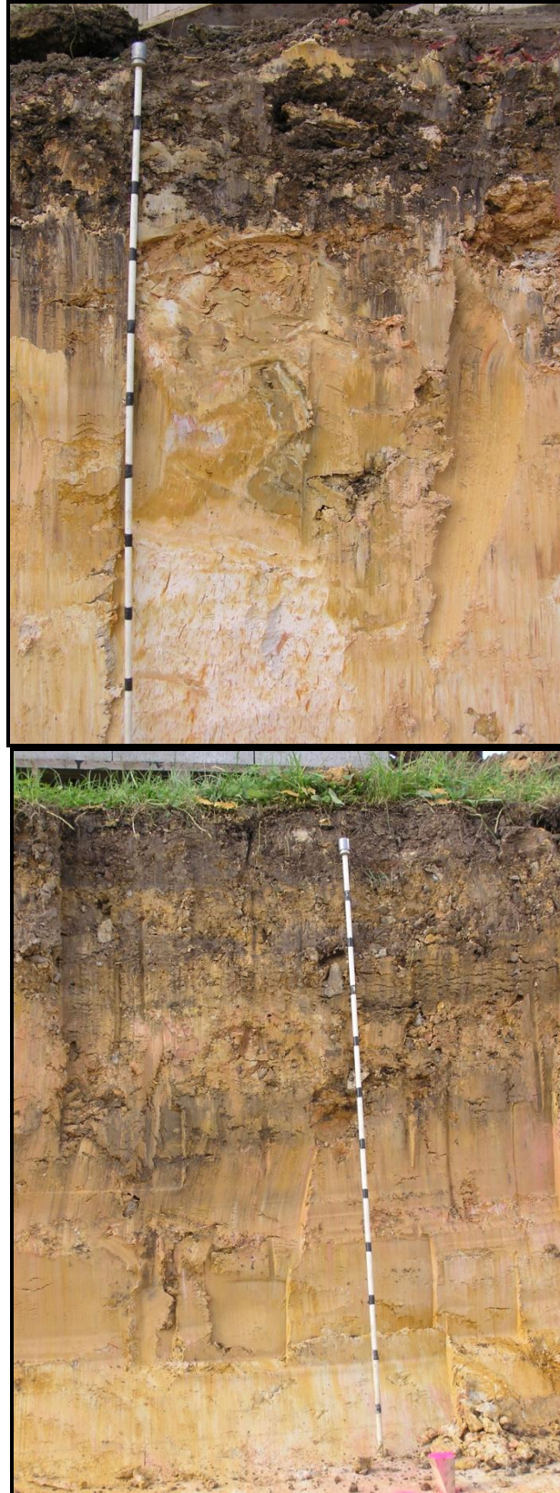
Figure 7. Earthworking Ultic Soils in West Auckland (left) and Albany (right) has caused significantly reduced permeability to very low (Hydrological Class D); created massive soil structure; mixed topsoil with subsoil and regolith materials; and grey and red mottling has developed throughout the profile. (scale in 10 cm increments)